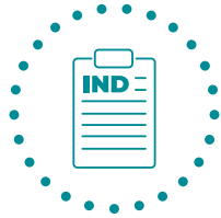
IND-enabling Preclinical Studies

Studies determining absorption, distribution, metabolism and excretion (ADME) characteristics of drug candidates in laboratory animals and humans are an integral part of the drug metabolism and pharmacokinetics (DMPK) services provided by QPS. DMPK projects cover a drug development program from the discovery, candidate selection, investigational new drug (IND) enabling, through new drug application (NDA) stages.