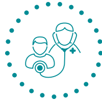
Human AME Studies