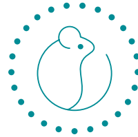
Radiolabeled ADME Studies