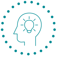
Medical Strategy & Insight

QPS Global Medical Affairs (GMA) cares about your unique clinical development program and the patients you serve. Our team is committed to providing deep scientific and medical expertise to enhance your custom-built research. We are comprised of a team of experienced scientific and medical experts who can provide strategic advice and clinical development support to ensure your clinical study success.