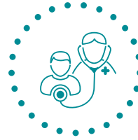
Clinical Development Expertise